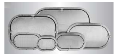
Low Air Leakage Access Doors

Lloyds Systems LLC 2911 W. Omaha St. Rapid City, SD 57702