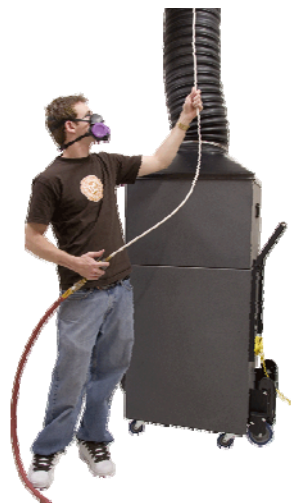
10 Inch Hose Interface

*Please contact Lloyds Systems LLC for the latest product information.