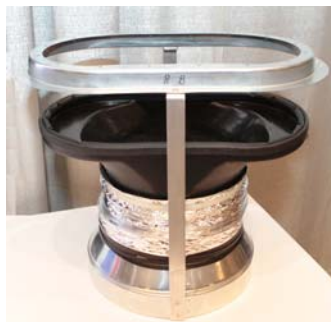
VA-2500-CC (Duct Quick Connect)

*Please contact Lloyds Systems LLC for the latest product information.